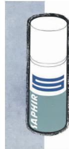
Archives Maison Saphir - 1970